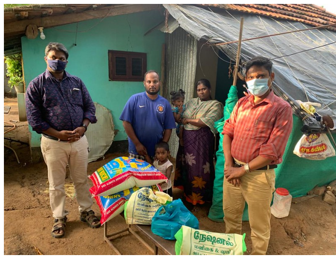
Deliveries of food and aid were made to families who could not come to St. Mary's School

Our State Government has announced the opening of schools for grades 9-12 for non-disabled children. However, it will not allow the schools for special needs children like handicapped, deaf-mute, blind, etc because they say that these children may be more easily