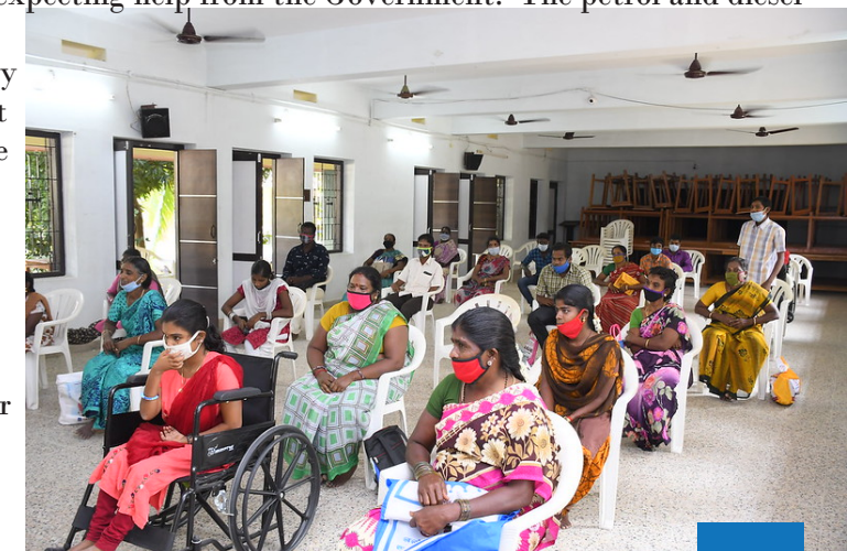
St. Mary's families receiving food and aid made possible through your generosity