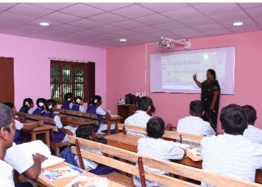
The Smart Classroom at St. Mary's.

The children are thriving at St. Mary's. Thanks to your generosity and support, the children live on campus and receive an excellent education, nourishing food, and housing. The teachers do more than just teach. They also help and console the new students who might be leaving home for the first time. They help them through their home sickness and separation anxiety. The warden who takes care of all the students treats them with kindness, like the heart of a mother. She makes the students feel welcome and safe. They are very happy here, and are so grateful to you, our donors, and to our Lord, Jesus Christ.