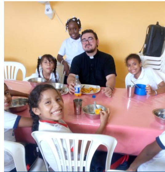
San Jose Soup Kitchen in Guayaquil