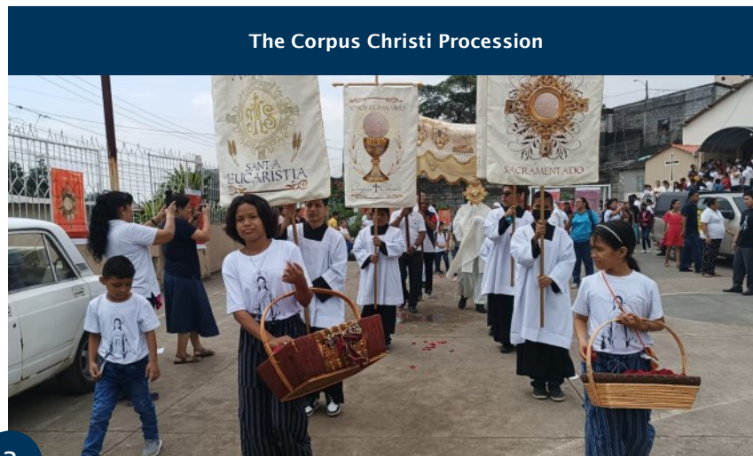
The Corpus Christi Procession