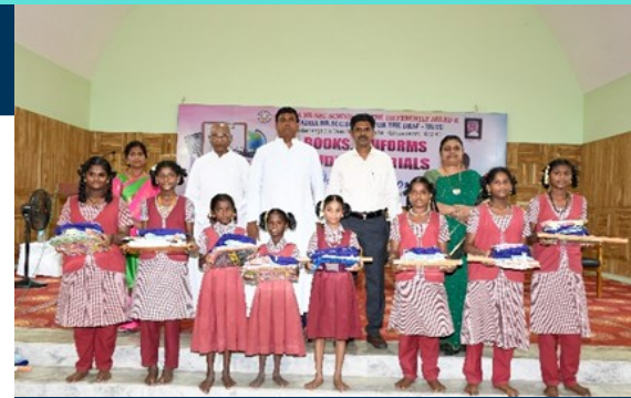
St. Mary's students receive school supplies and uniforms for the new school year.