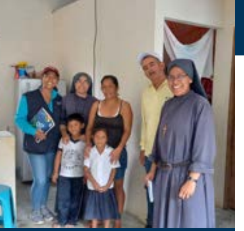
Sisters with two school children and their families