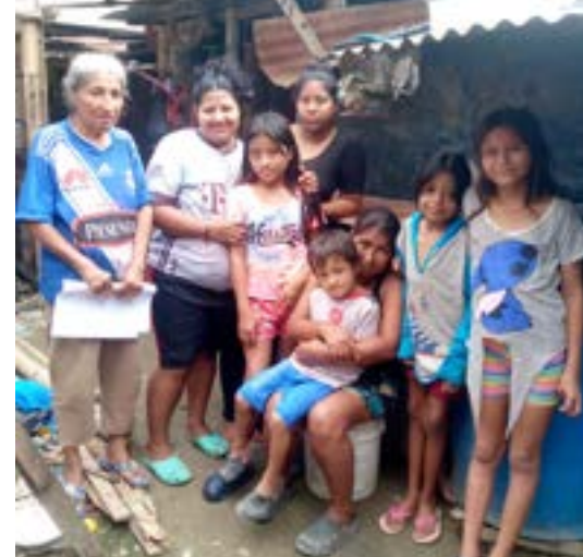
A family in the poorest sector of Guayaquil

This is only part of what we are able to enjoy, thanks to your generosity. As we always tell you, we have the privilege of being direct witnesses to these works of mercy, but nothing could be done if the Lord had not touched your hearts with love and shared with you His same generosity towards His poorest.