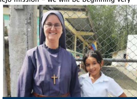
Sister with a local student

The Community of Servant Sisters in Portoviejo