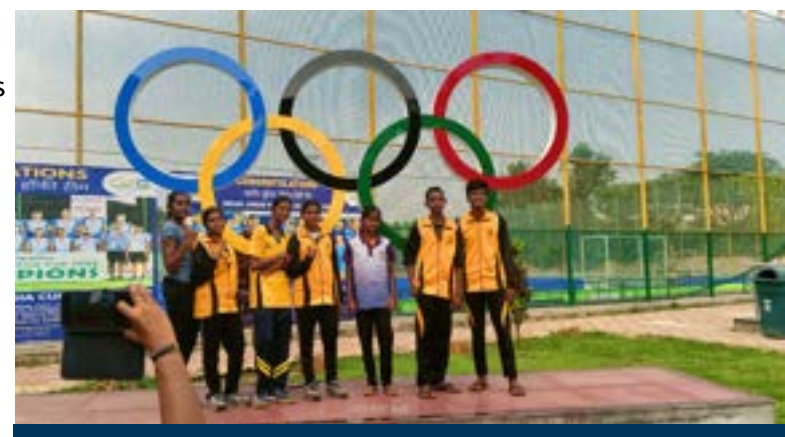
Selection Trials - Winners from St. Mary's