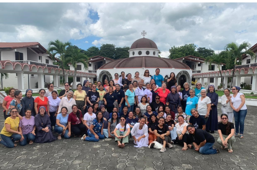
A gathering with the lay adults of Home of the Mother.

During the summer vacation, many children and young people are coming to our camps, Holy Week gatherings, youth programs, etc. It is a celebration of so much spiritual work being done in these young souls!