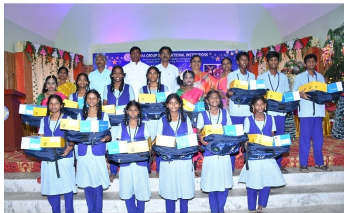
Students of St. Mary's with their new shoes, purchased with your donations.