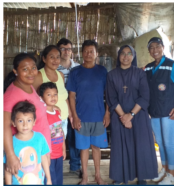
A local family in Guayaquil.