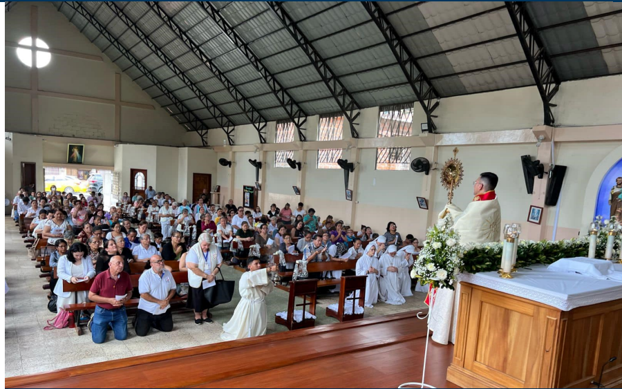
Mass with the Home of the Mother and local parishioners.

A few months ago we started having holy hours in Riochico, and it is going very well. The hope is that soon we will be able to open an adoration chapel in the parish. This is a victory, especially for us whose mission is the defense of the Eucharist! We count on your prayers.