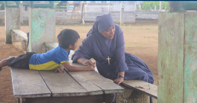
Children in the School Support Program