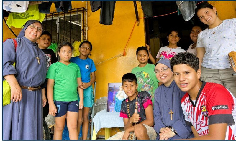
A Family enrolled in Catechisis

The Servant Sisters of the Home of the Mother Chone, Ecuador