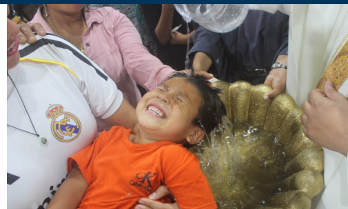
Baptisms in the Indigenous Communities